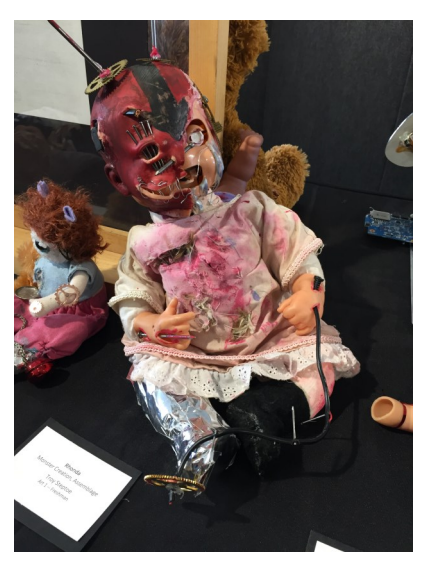
EXHIBIT: "When We Make Monsters" Creeps the Portables